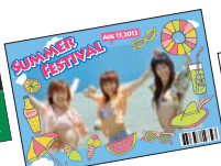
Theme park photo